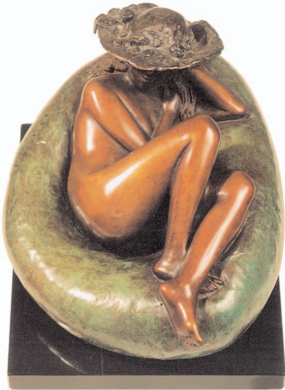
The Flowered Hat edition 8/10 17cms