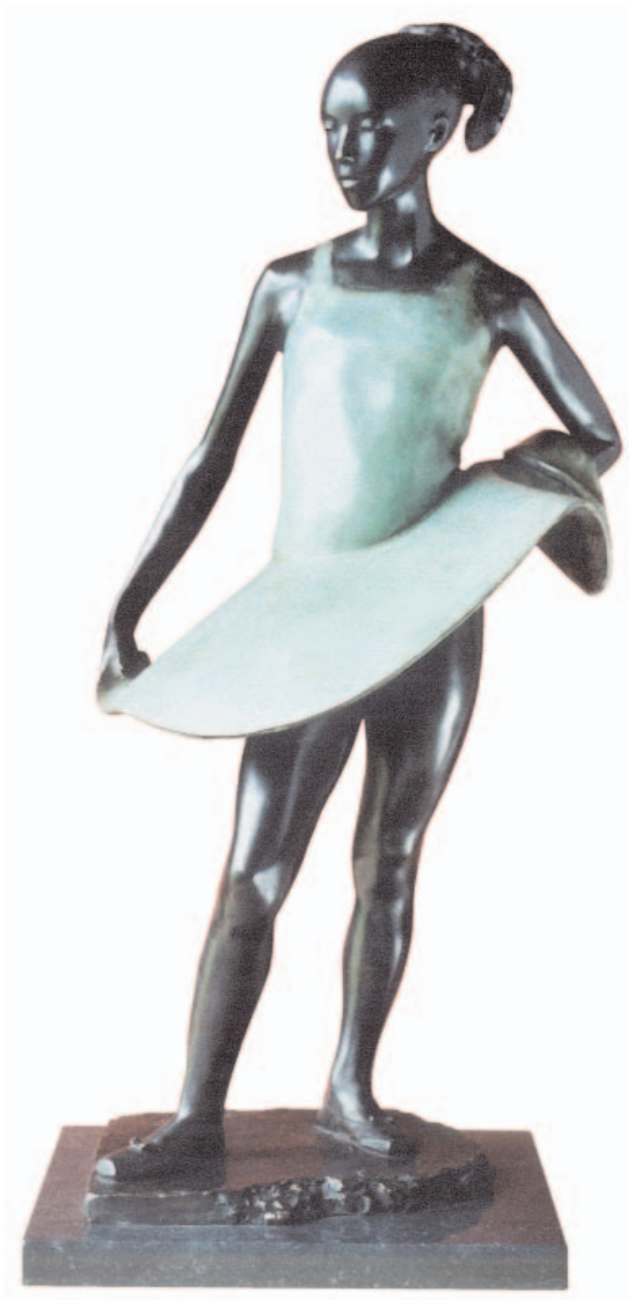
The Beautiful Dancer edition 8/10 62cms