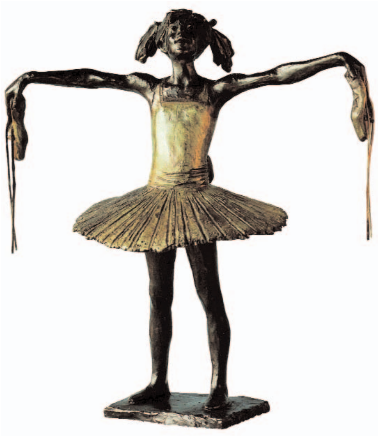
The Joyful Dancer edition 3/10 54 cms