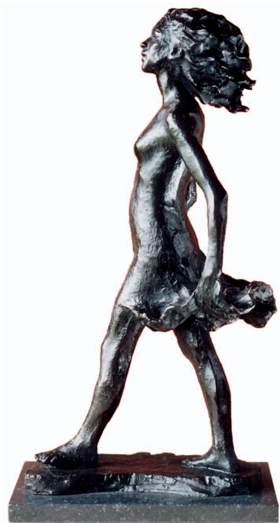
Girl Walking edition 5/10 55cms