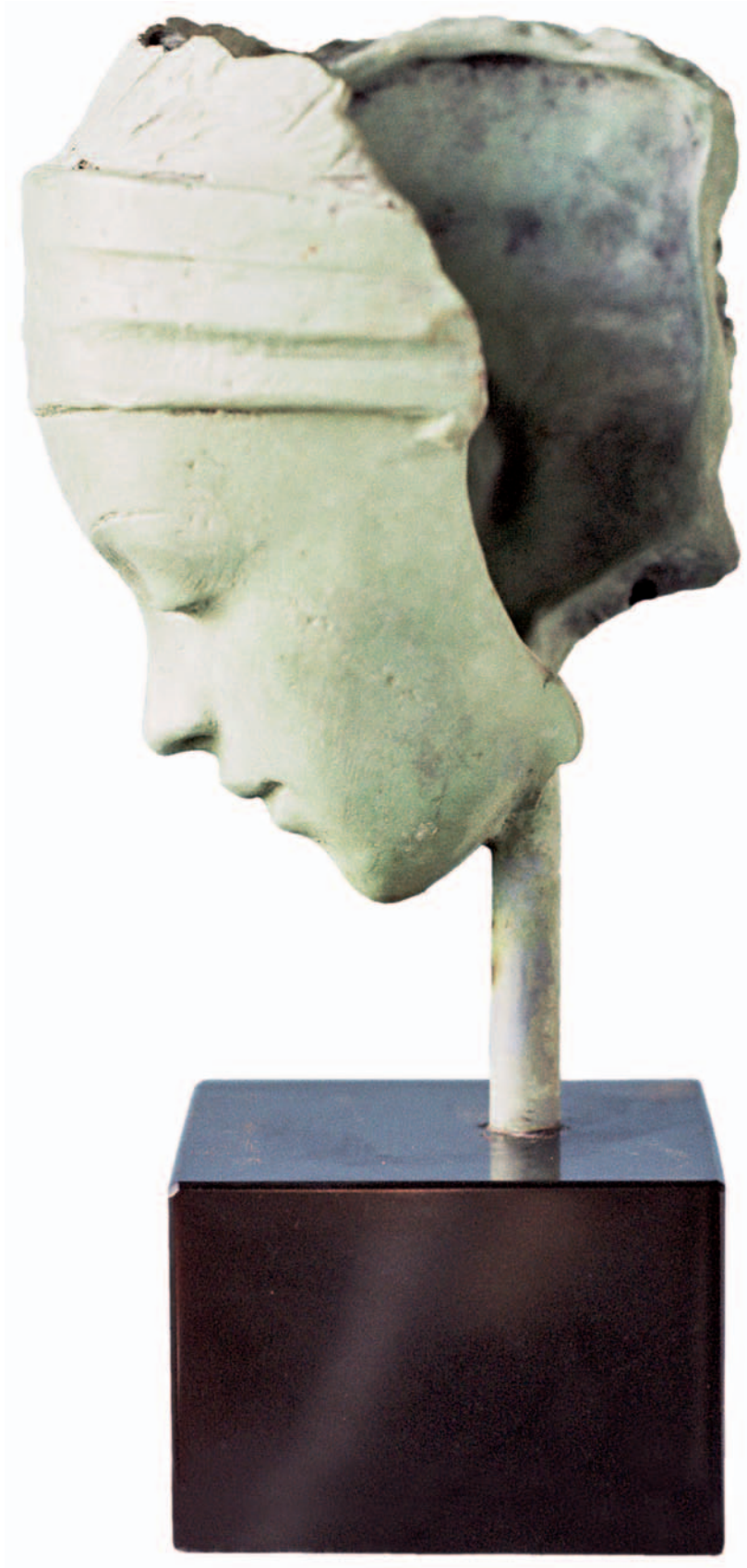
Head Fragment edition 3/25 25cms