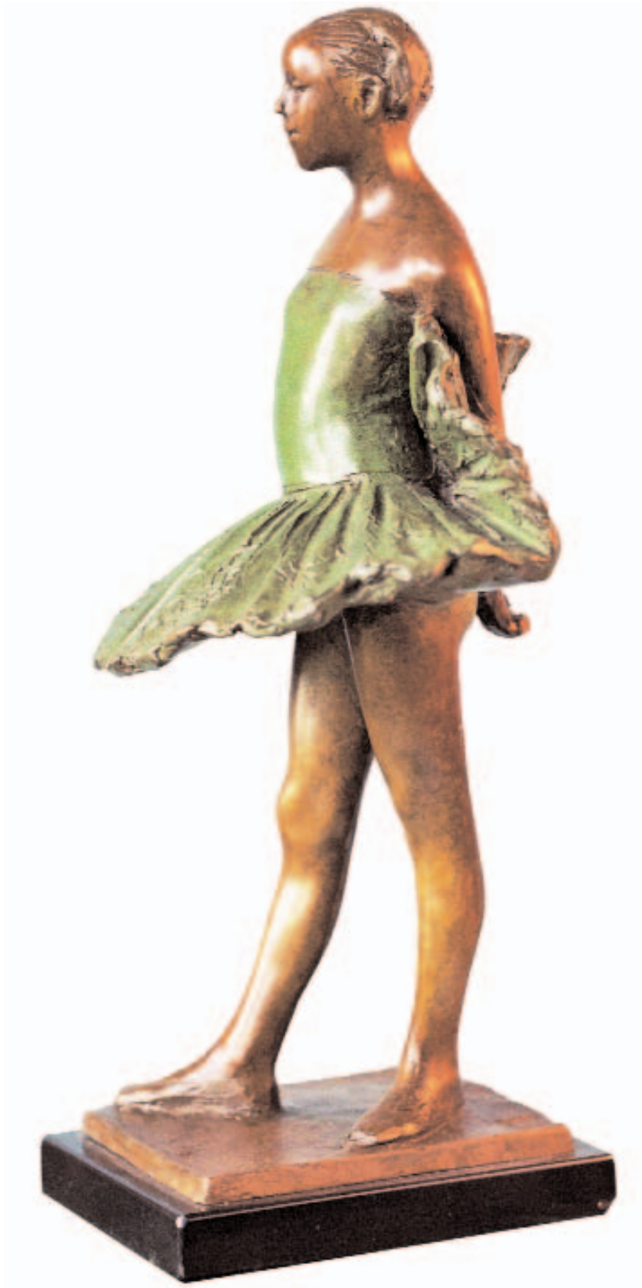
Young Dancer Sketch edition 4/12 33cms