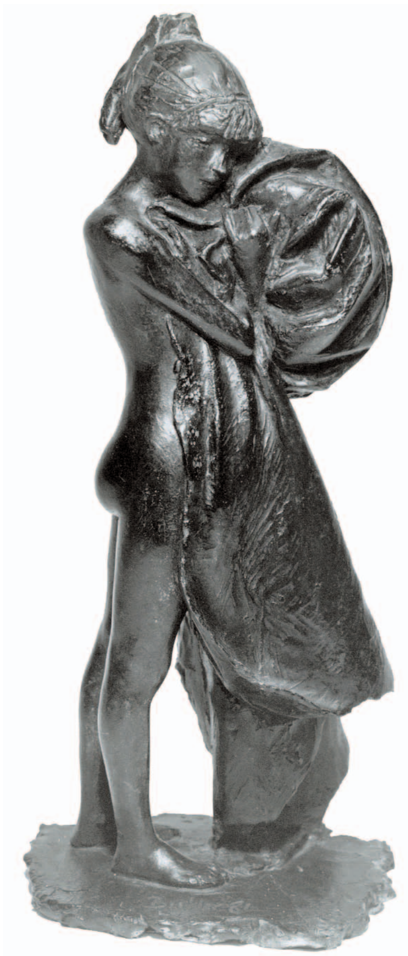
Girl with a Blanket edition 6/10 12cms