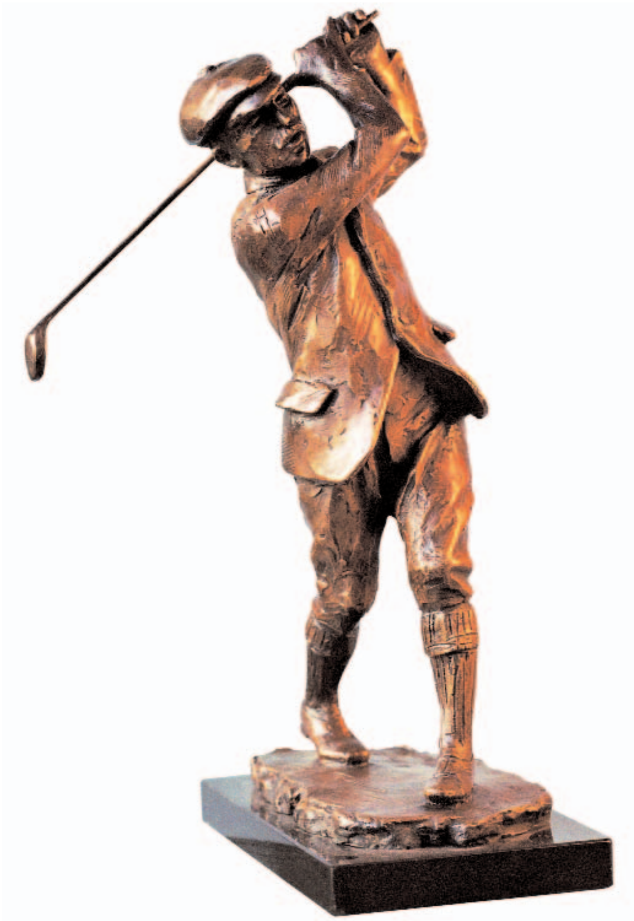
A Tribute to Harry Vardon edition 9/15 39cms