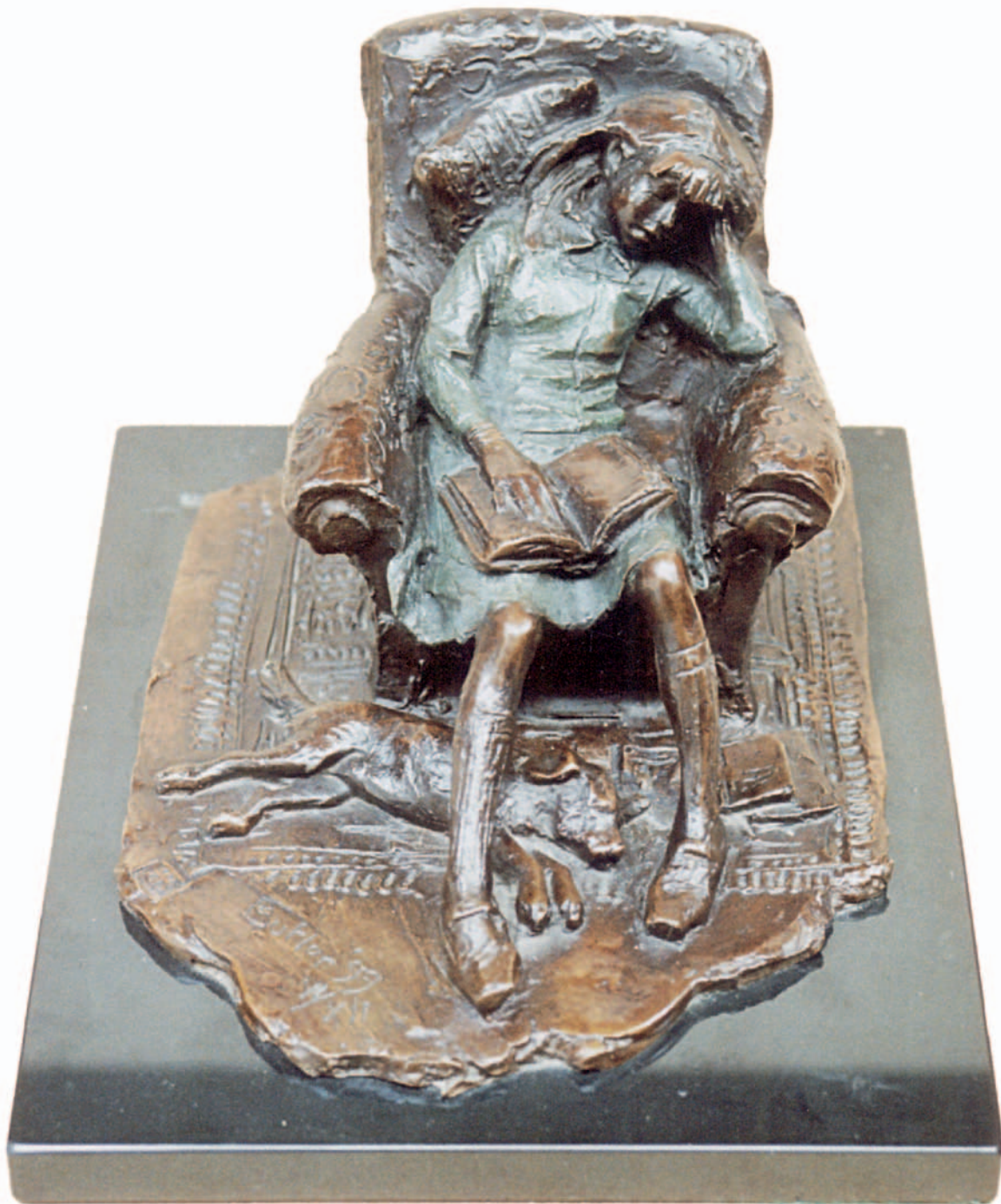
Homework edition 6/12 17 cms