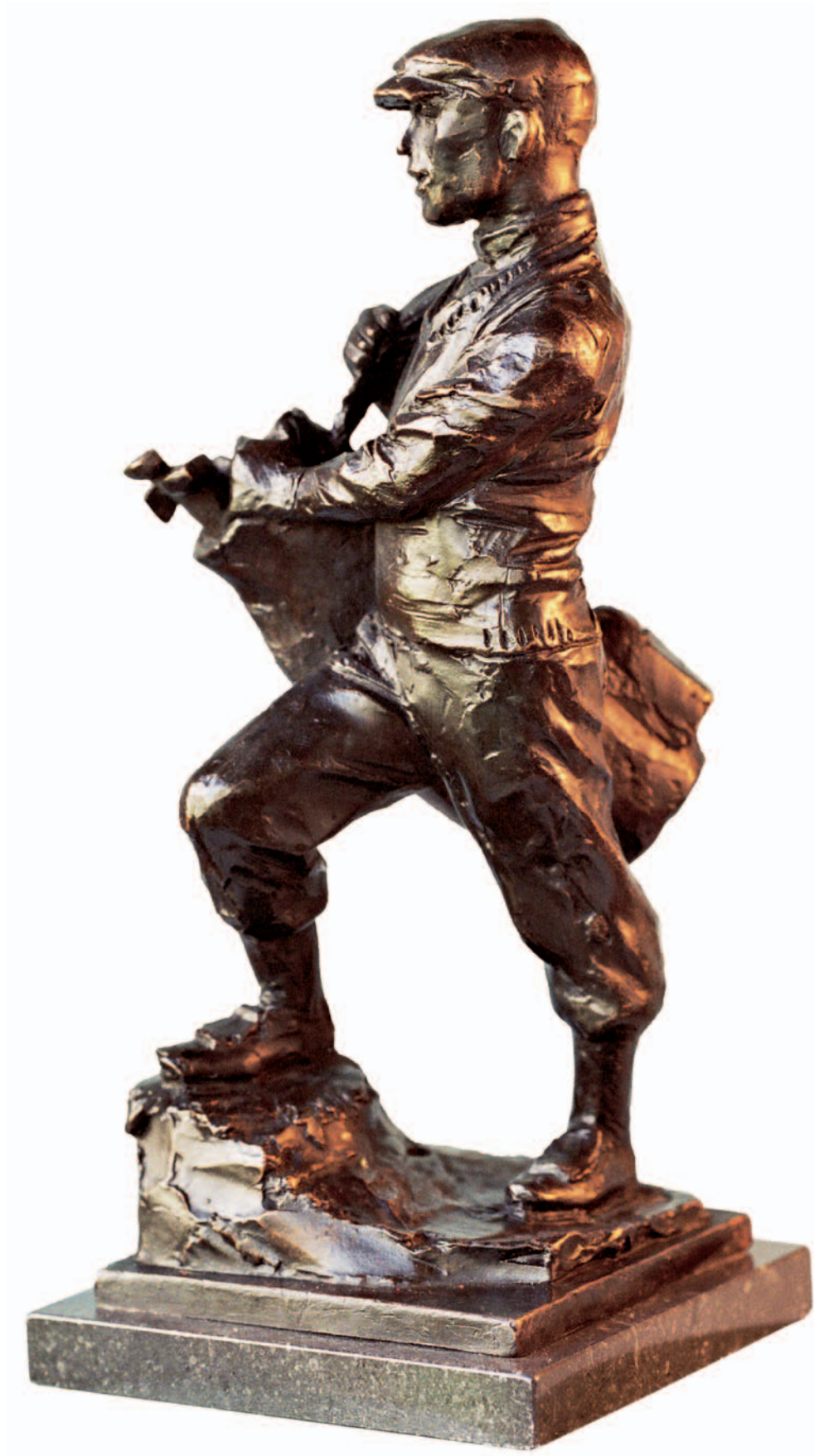
The Caddy edition 5/12 36cms