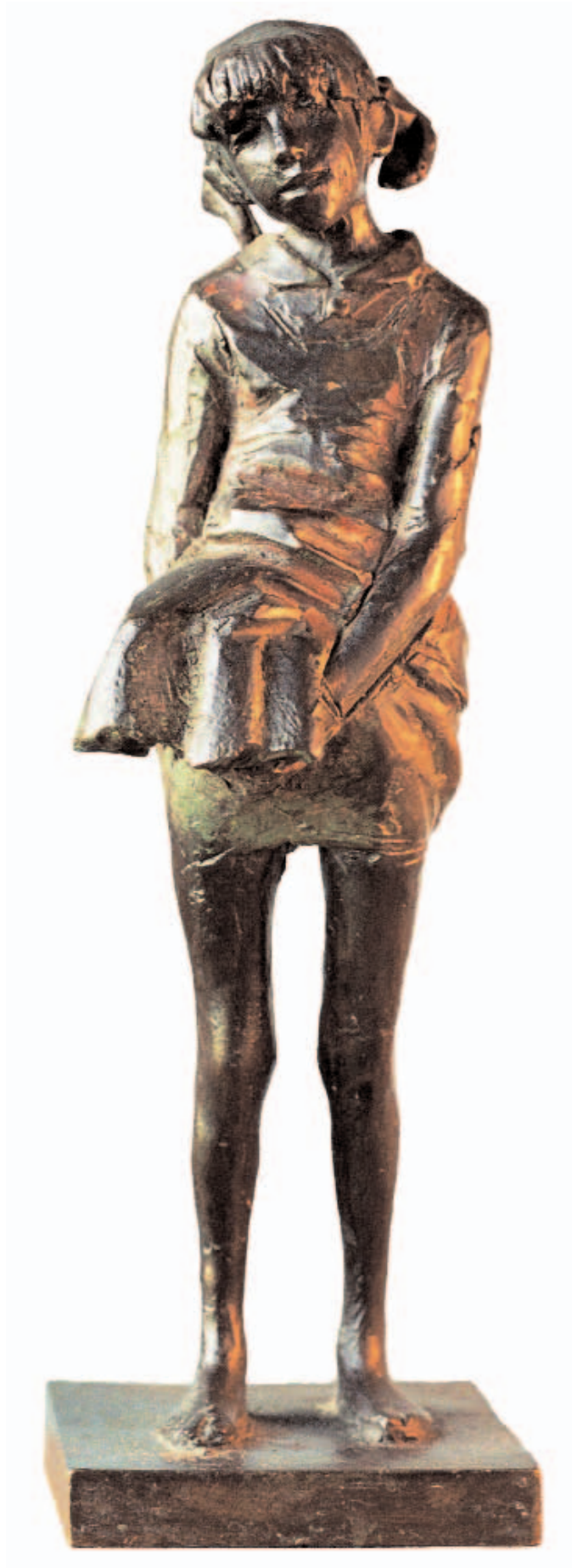
Girl holding her Skirt edition 1/10 15cms